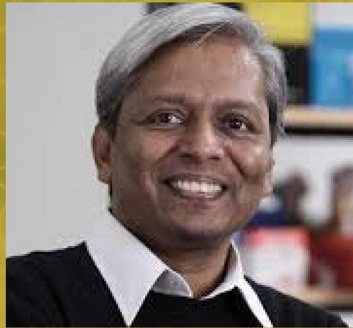
Prof. K. VijayRaghavan, PSA, GoI